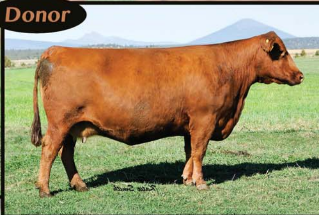
ECHO FRANCES 2519 • 2/16/2005 Sire: Beckton Lancer F442 T • Dam: Echo Ramon 2519 CED 5 BW -2.4 WW 47 YW 66 MILK 12 TM 36 ME 2 HPG 6 CEM 5 STAY 9