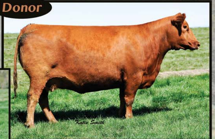
RAISLAND BELLA 001-429 • 1/09/2010 Sire: Red Fine Line Mulberry 26P • Dam: Raisland Rebella 429-502 CED -1 BW -1.3 WW 68 YW 112 MILK 16 TM 50 ME 5 HPG 11 CEM 10 STAY 10