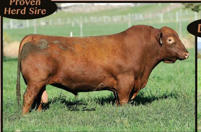
REDHILL B571 JULIAN 1W • 1/02/2009 Sire: Beckton Julian GG B571 • Dam: 1BWI Barmaid 54P CED 16 BW -4.9 WW 59 YW 89 MILK 22 TM 52 ME 1 HPG 14 CEM 2 STAY 19