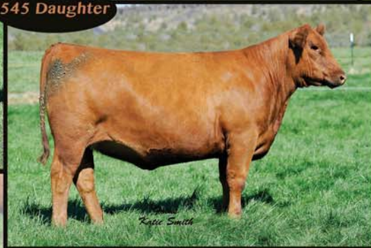
VF TAMARA A196-545 • 2/10/2013 Sire: Larson Masterpiece 009 • Dam: Larson Tamara 545-556 CED 5 BW -1.9 WW 63 YW 94 MILK 22 TM 54 ME 3 HPG 11 CEM 5 STAY 13