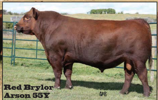
Red Brylor Arson 55Y

• Semen packages on our new Red Angus herd sire - the $30,000 Red Brylor Arson 55Y