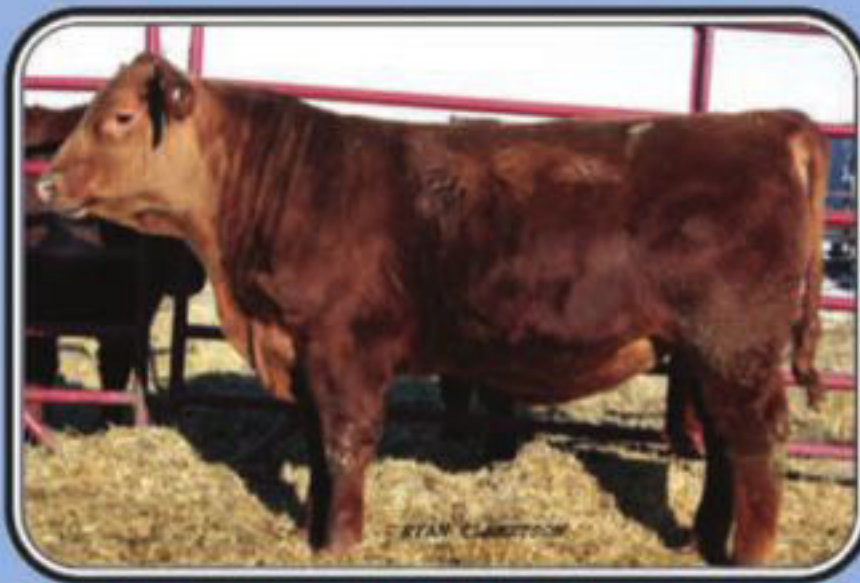
TRCC MR. THUNDERHAWK 29Z