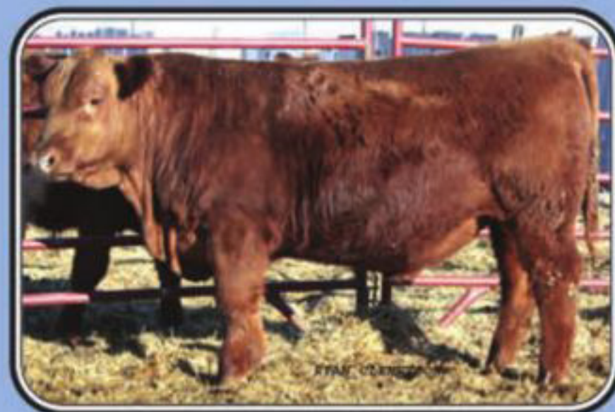
URIELL NO DOUBT 9018-3Z

REG #1511036 SIRE MESSMER PACKER S007 X BADLANDS PFFR NEW DESIGN 347