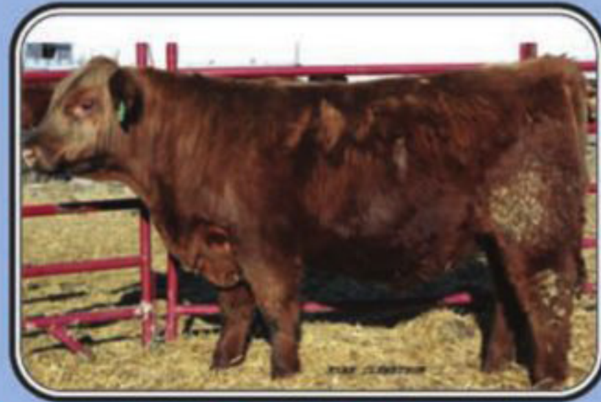
TRCC SAKIC 4Z

REG. #1508902 SIRE 5L DESTINATION 893-6215 X GILCHRIST UPTREND N304