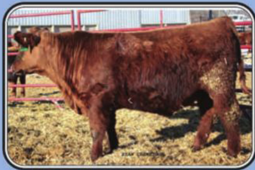
TRCC EAST RIVER 1Z

REG. #1519210 SIRE LMG GILLS NO DOUBT 9018 X RED WILBAR BRANDED BEEF 628S