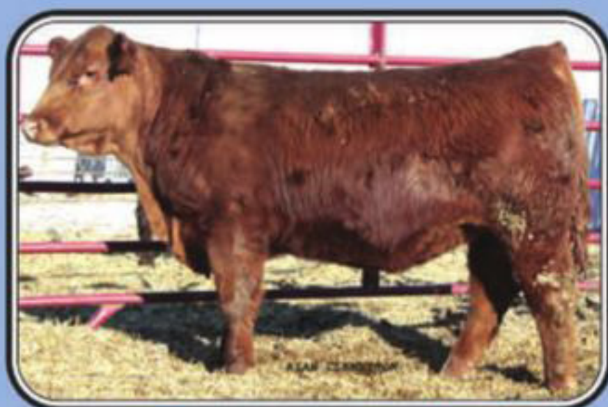
URIELL'S RED ROCKER 903-7Z

REG. #1511055 SIRE RED NORTHLINE ROCK STAR 911U X RED FINE LINE MULLBERRY 26P