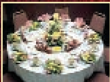
Outstanding Fine Dining