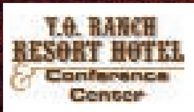
Our Convention 2006 Venue